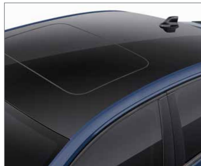
»» Dual Tone Roof with Electric Sunroof