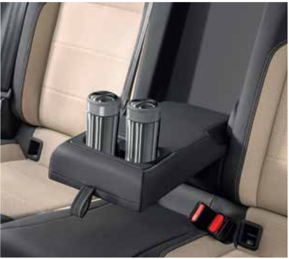
Cupholders In The Armrest