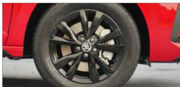
» R16 Black Alloy Wheels