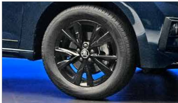
» R16 Black Alloy Wheels