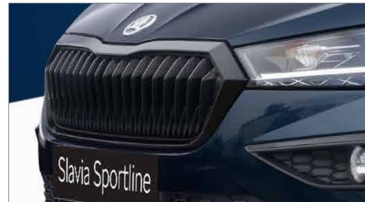
» Black Škoda Signature Grill