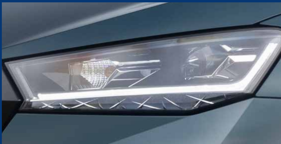
»» LED Headlamps with DRLs