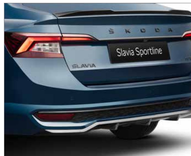
»» Sporty Black Exterior Package