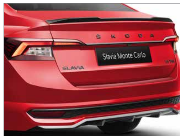
»» Sporty Black Exterior Package