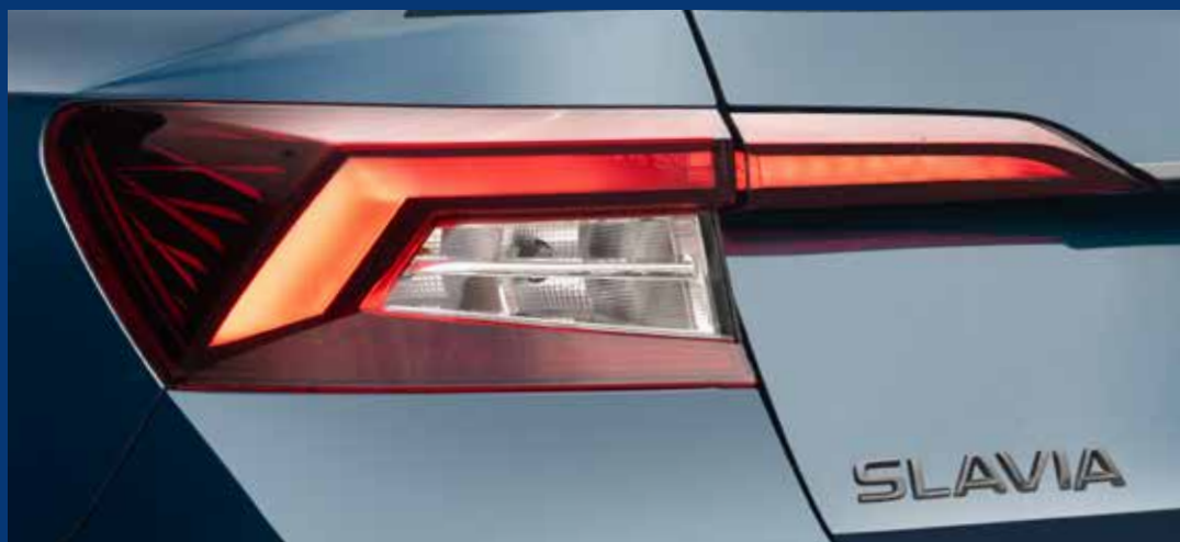
»» Darkened Tail Lamps