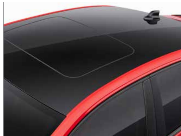
»» Dual Tone Electric Sunroof