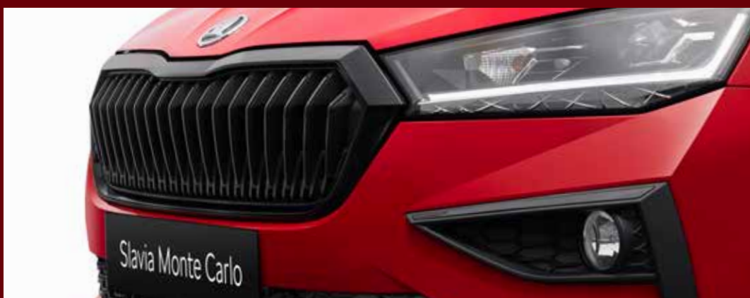
»» Black Škoda Signature Grill