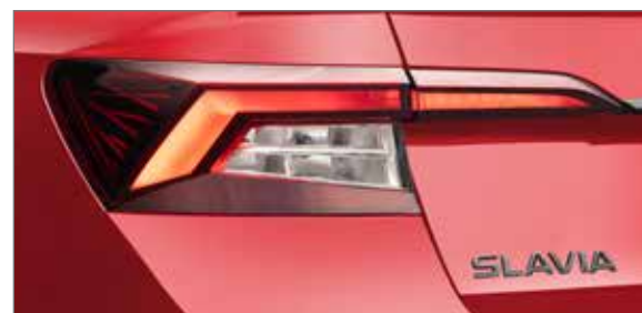
» Darkened Tail Lamps