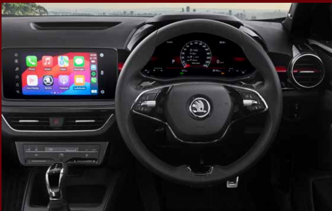
»» 20.32cm Škoda Virtual Cockpit with Red Theme