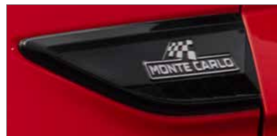
» Exclusive Monte Carlo Badging