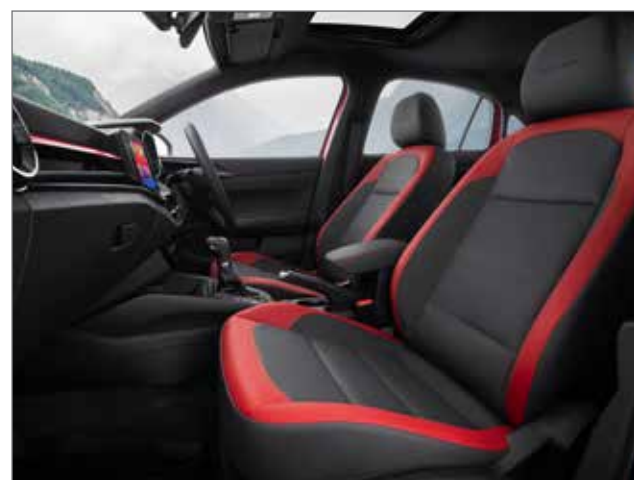
»» Monte Carlo Incribed Ventilated Front Leatherette Seats