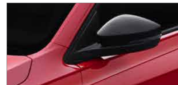
» Glossy Black ORVMs